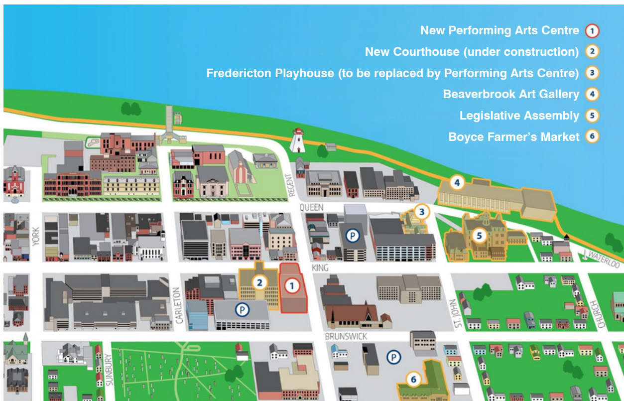
Map locating the site of the Performing Arts Centre

With its front door on King Street and its façade wrapping around the corner onto Regent Street, the Performing Arts Centre is ideally situated in the heart of downtown Fredericton with proximity to the Historic Garrison District, the Beaverbrook Art Gallery, the Provincial Legislative Assembly, parking, restaurants, tourist accommodations, shops, services, and cultural institutions.